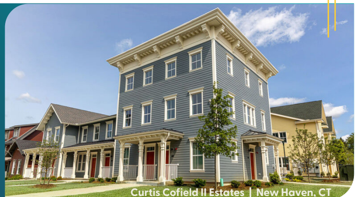
Curtis Coffield II Estates | New Haven, CT