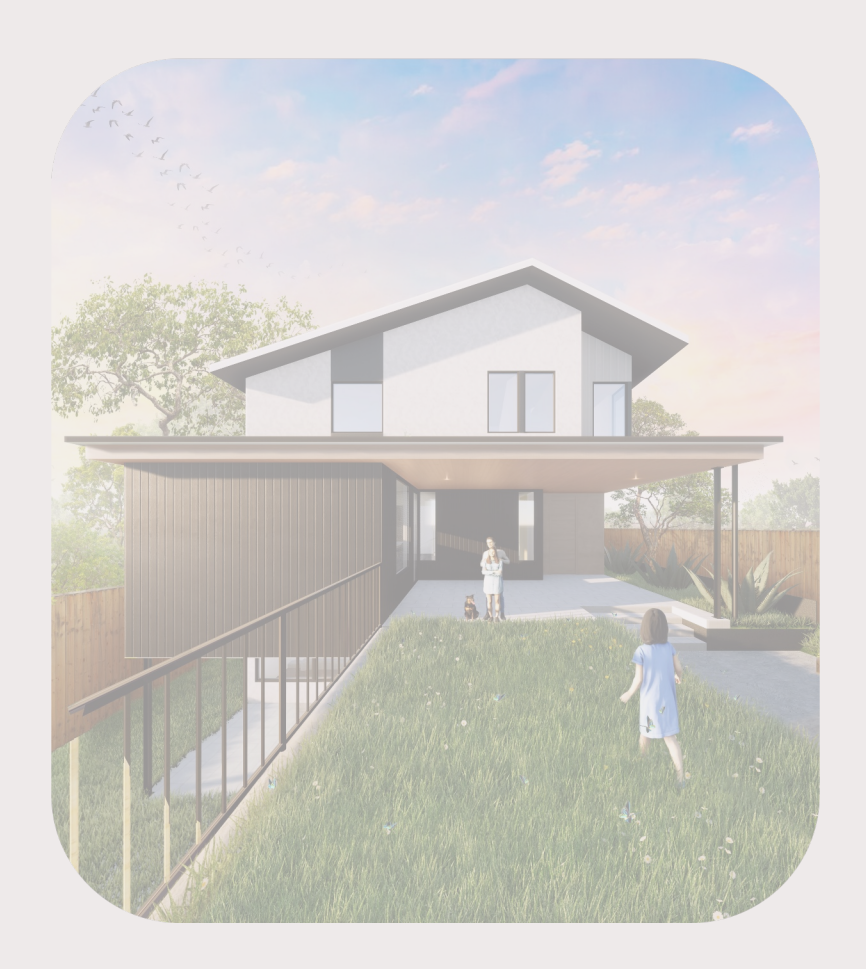
Theresa Passive House