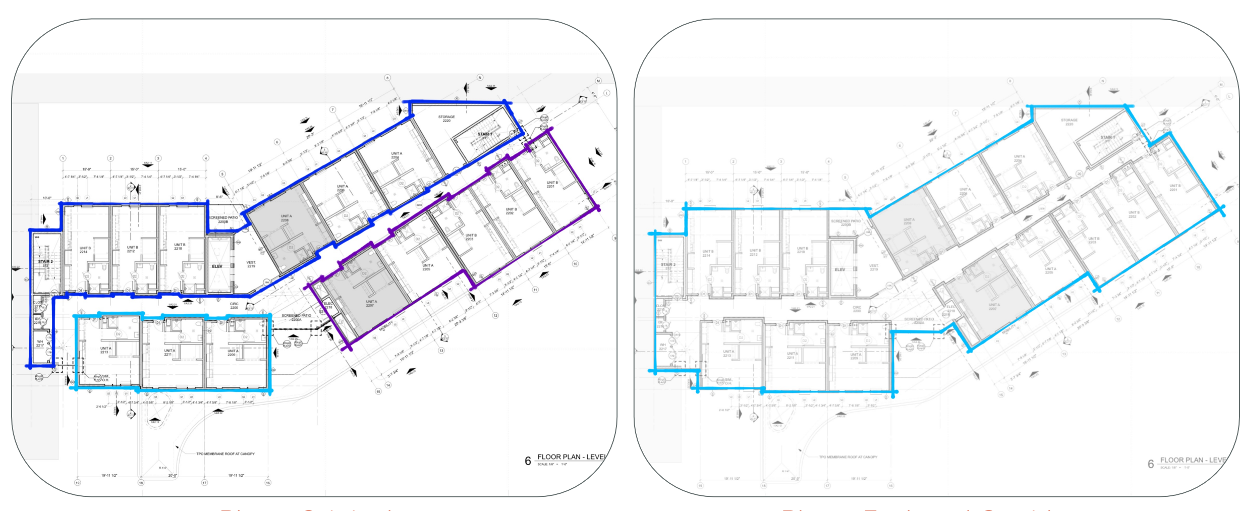
Plan - Original