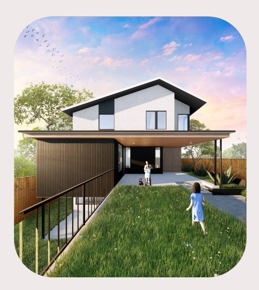
Theresa Passive House